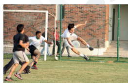
Mini Field (for Frisbee, Cricket, Football etc.)